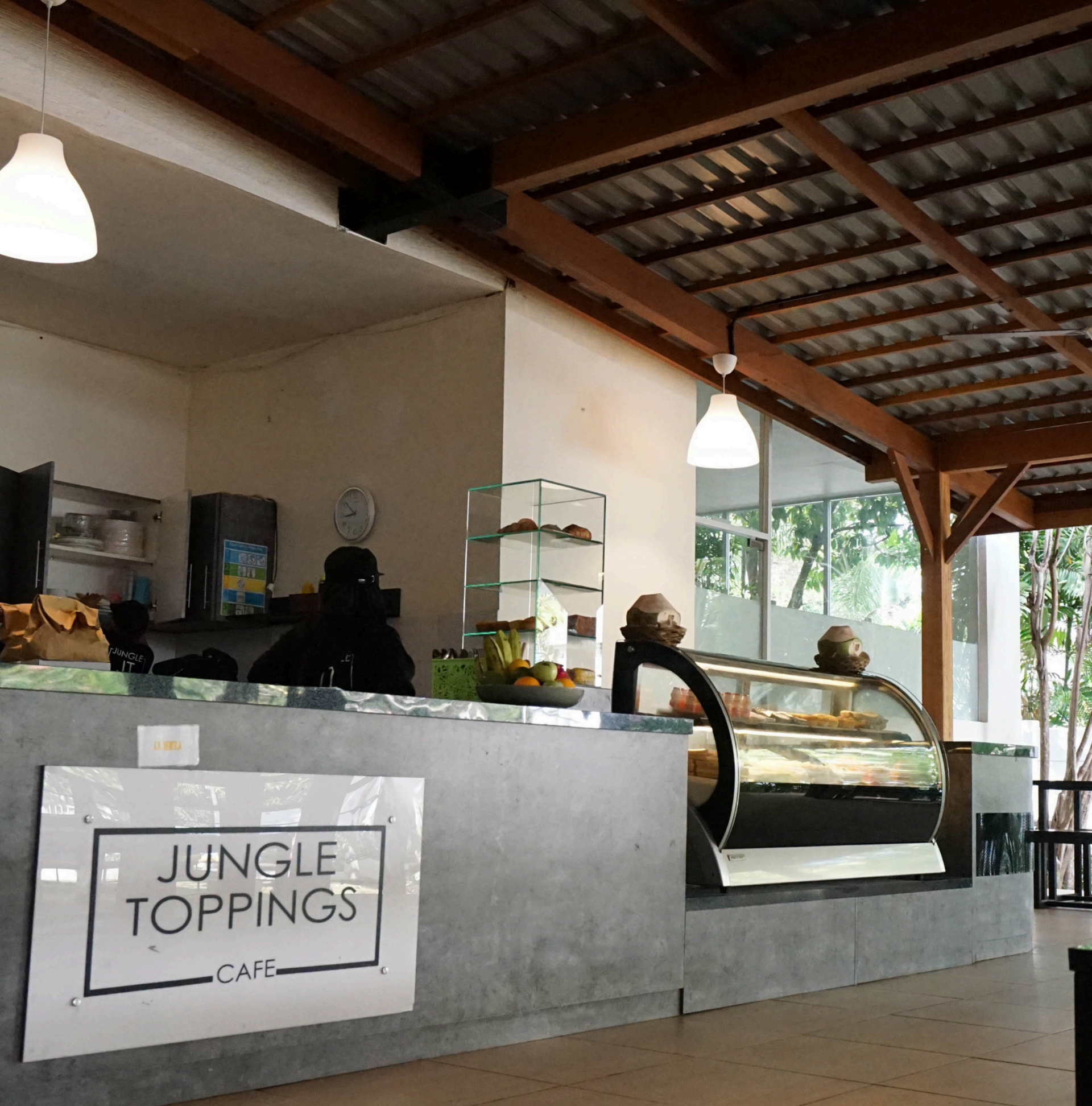
Jungle Toppings Cafe